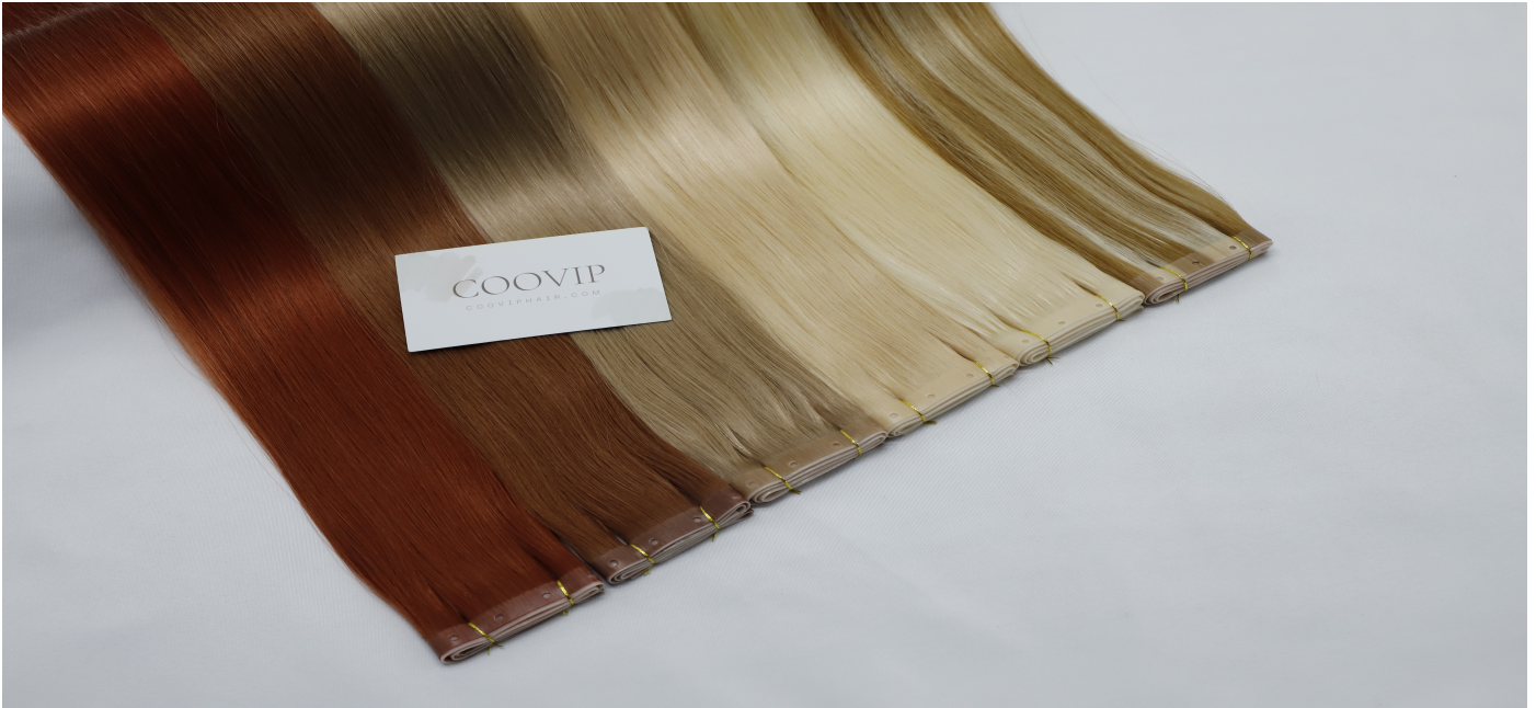
COOVIP Butterfly Weft (XO Invisible Weft) — 100% Raw Human Hair | 60+ Shades | No Glue · No Heat | Micro-Bead Install

COOVIP Butterfly Weft Hair Extensions — also known as XO Invisible Weft — feature a unique dual-sided design: one side is an ultra-thin invisible weft, the other a PU base with pre-punched holes. Built on 100% single-donor raw human hair with cuticles fully intact, this weft lays completely flat against the scalp for the most natural, undetectable result. No glue, no heat — installed with micro-beads only.