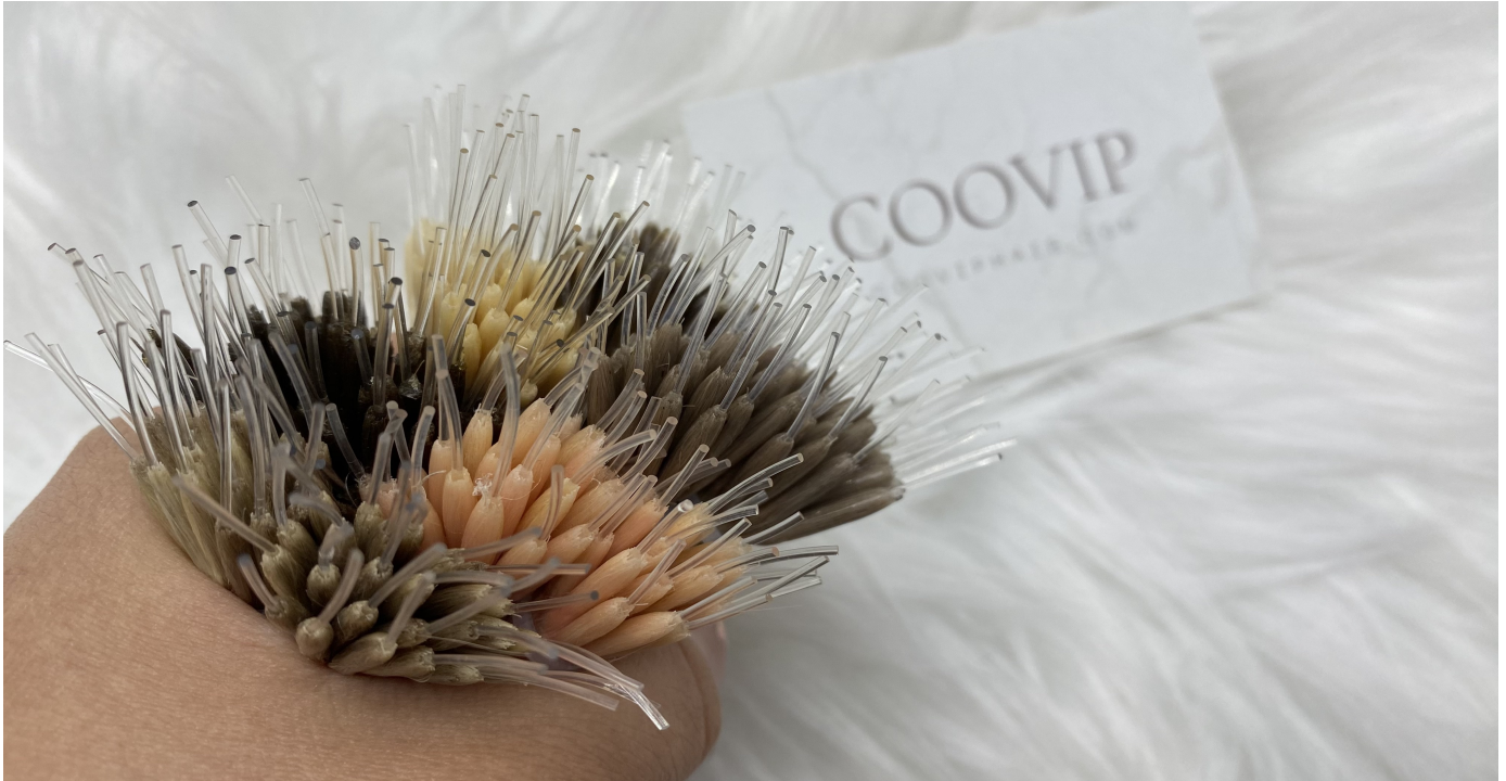
COOVIP Nano Bead Extensions — 100% Raw Human Hair | Smallest 2mm Bond | No Heat · No Glue

COOVIP Nano Bead Hair Extensions feature the smallest bond available — a 2mm micro nano ring that is virtually invisible once installed. Built on 100% single-donor raw human hair with cuticles fully intact, these extensions deliver unmatched natural movement, shine, and longevity with zero heat and zero glue.